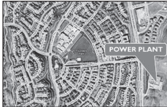
Similar unit in Stanton, CA

Site for this "Peaker Power Unit" is right in our neighborhood.